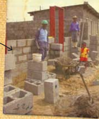
Bytown Orphanage project, Lesotho. Rental units provide long term sustainable income.

Enjoy the Fun and Fellowship Fabulous team prizes African Art Auction